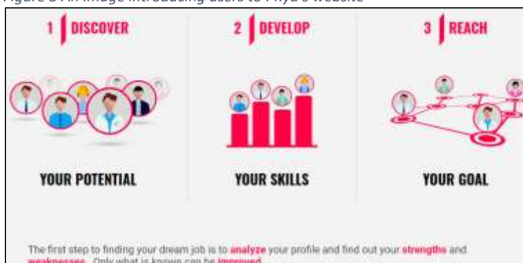
Figure 3 An image introducing users to Phyd's website

Phyd is technologically innovative, leveraging cloud computing and AI to process data on the local labour market and address employability and skill gaps. Through the assessment tools, the users' professional and educational information, and labour market data, individuals can gain an objective view of their position in their labour market (Figure 3).