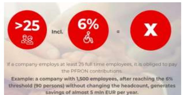
Figure 7 PFRON contributions

Benefits for workers, companies and society: As indicated above, the programme is beneficial for workers and companies, and its impact is also visible beyond these two groups. Workers benefit from improved integration in the labour market and can rely on the benefits connected with having a disability certificate. For companies, there are significant economic and non-economic benefits. The economic benefits include exemption from PFRON contributions, which can be quite high for larger companies as illustrated (Figure 7), as well as reimbursement of costs related to the use of equipment at the workplace or workplace adaptation, additional financing for the remuneration of employees with disabilities and their assistants, and the co-financing of training costs for these employees. The non-economic benefits for companies could encompass improved branding, corporate social responsibility, recruitment of loyal and motivated employees, etc. Job Impulse further collaborates with civil society organisations to ensure support and take-up of the programme. In that way, the programme has a societal impact that extends beyond its users. In January 2020, Job Impulse launched a foundation to support its ambitions.