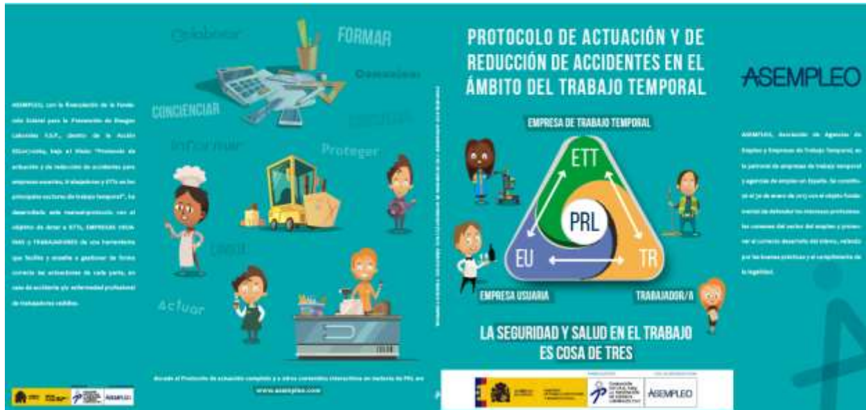
Figure 8 ASEMPELO information leaflet

The final output of the project was a book , information leaflets and an interactive multimedia tool . The book explains the protocol (detailing standardised steps to be followed, actions to minimise risks) (see Figure 8). The interactive tool was developed for five sectors, identifying the key risks for jobs in these sectors. The information presented in all of these outputs is clear and concise, and the communication channels are clearly identified for an effective and efficient communication strategy.