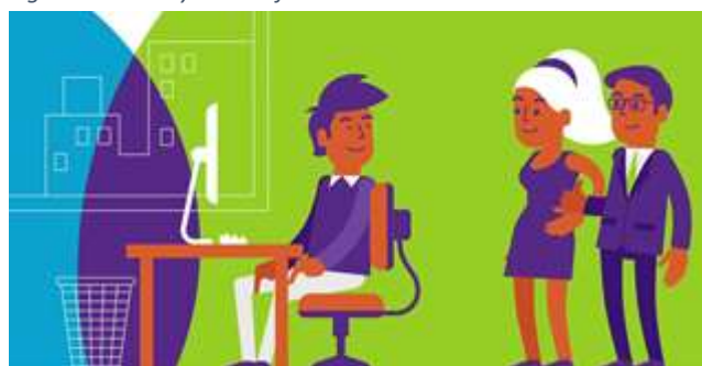
Figure 5 Four key areas of the DIS scan