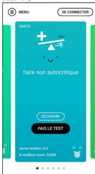
Figure 1 Mobile view of the Testyourselfie website (Do your self-assessment)

Testyourselfie is innovative as it offers a tool to create awareness, discuss and assess soft skills. At present, the initiative targets young people and their educators rather than employers or workers directly. Nevertheless, awareness of soft skills is a relevant challenge for everyone currently in, or soon to join, the labour market.