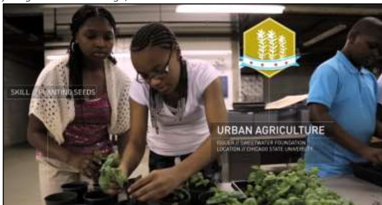
Figure 2 The Sweetwater Foundation issues the Urban Agriculture Badge for young learners in Chicago, Illinois

Moreover, there is growing interest in developing and validating micro-skills and soft skills. 21 Soft skills, such as teamwork, an innovative mindset and personal initiative, are increasingly important in the labour market. Open Badges can account for these and is very precise in specifying an individual's skills.