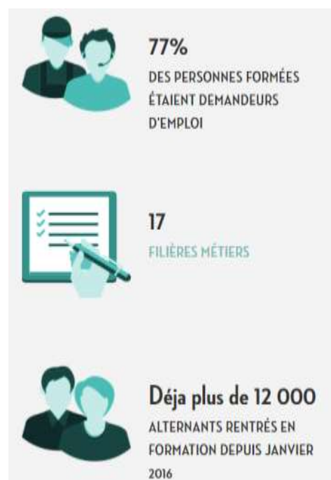
Figure 4 A summary of the results on the website

Still, programmes similar to the Grande École de l'Alternance have been implemented in other formats in other countries. Key components of the programme that should be replicated include ex ante analysis of the local labour market, the involvement of both the host company and training provider, and the double tutoring scheme. Nevertheless, funding is a significant challenge outside France. In previous attempts to expand the programme beyond France, it proved difficult to secure adequate funding, so the programme's implementation was limited and its impact quite small.