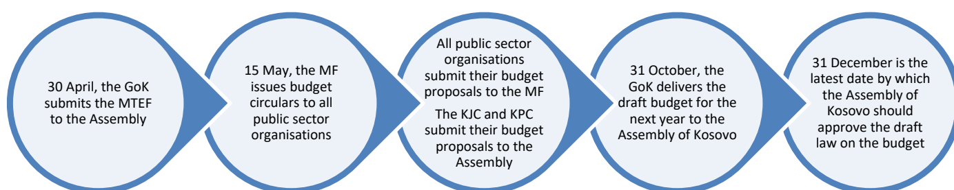
Figure 1. Budgeting process – a timeline

Note: GoK = Government of Kosovo; MF = Ministry of Finance.