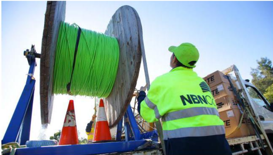
The NBN could become costly.

The Australian | 12:00AM October 15, 2016