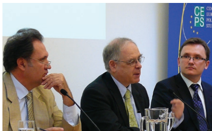
Terényi, Schöpflin &amp; Kaczyński

On April 26th, the day after the second round of the Hungarian Parliamentary elections, CEPS in cooperation with the Hungarian Institute of International Affairs (HIIA) organised a post-electoral briefing to assess the outcome and future prospects of Hungary in EU affairs. György Schöpflin, MEP in the EPP Group and member of the Hungarian Fidesz Party, outlined the major tasks his party faces following its landslide victory. With a two-thirds majority in the Parliament, Fidesz will focus on restoring the country's economy and reducing unemployment. The new government under Prime Minister Viktor Orbán will also introduce constitutional reform.