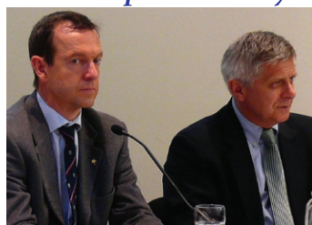
Gros & Belka

On May 12th, CEPS hosted the launch of the IMF's annual Regional Outlook for Europe, under the chairmanship of CEPS Director Daniel Gros. Marek Belka, Head of the IMF's European Department, presented statistics that confirmed economic recovery