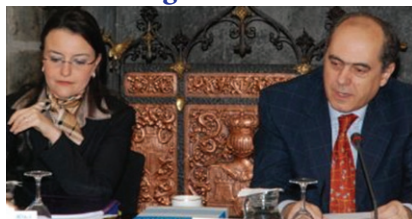
Ayadi & Florensa

Micro, small and medium-sized enterprises (MSMEs) are a key driving force behind economic development in the Southern